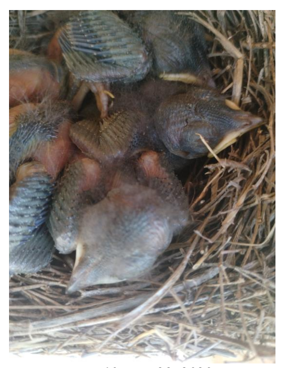
Box 10 June 29, 2023 This is the box near the Atrium