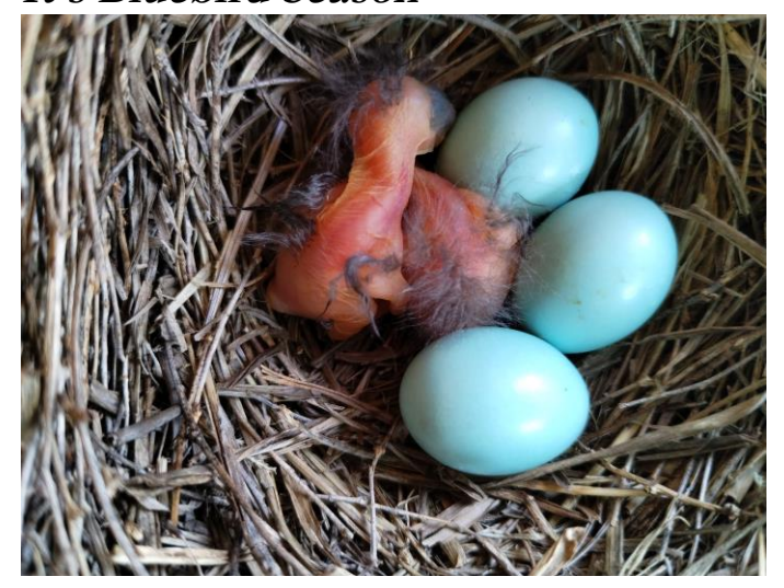
Box #10 June 22, 2022